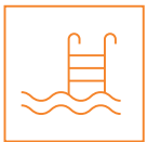
Swimming pool wet areas

Corrosion resistant non-metallic rods designed to safely support services in corrosive or sensitive environments.